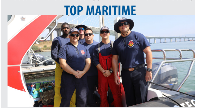
First Place: Alameda County FD (pictured); Second Place: Southern Marin FD; Third Place: Oakland Fire

First Place: Santa Clara County FD (pictured); Second Place: Contra Costa County-; Third Place: Alameda County